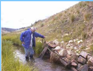
Larry Smolka (recently retires from Surface Water) inspecting a failed streambank structure on Coyote Creek